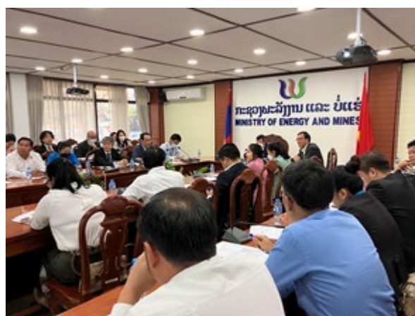
Start of on-site activities